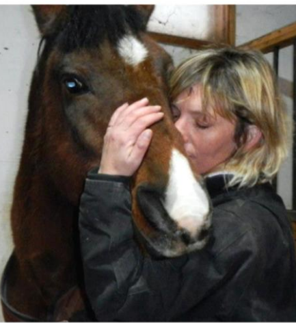
This is me getting lots of love.

It's been almost a year since Spring Hill rescued me from that dark barn. I just celebrated my 23 rd birthday! I'm still waiting for a new home but my humans at Spring Hill say I can stay as long as it takes to find one. Now that I can go outside I've gotten some of my vision back. I have a clean barn, plenty of food and water, and I know I am safe here. I love to feel the warm sun on my back, the taste of green grass, the smell of fresh air, and to hear the snow crunch under my hooves. I'll be forever grateful for what Spring Hill has done for me, my two herd mates and the new friends I've made here. I'm grateful to you and all of Spring Hill's supporters too! THANK YOU!