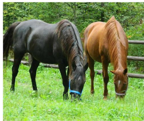
Smokey & Dorothy in their new home.