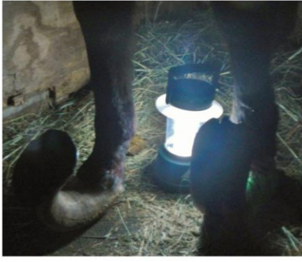
This is what my hooves looked like the night of my rescue.

of animals in need and offer all of this free, with no cost to tax payers. I heard the humans talking about one of the cases where they took in 62 animals all at once! You can imagine what it costs to do this important work. Goodness, my rehabilitation alone cost thousands of dollars! When you contribute to Spring Hill you are contributing to the care of us animals and supporting Spring Hill's much needed services.