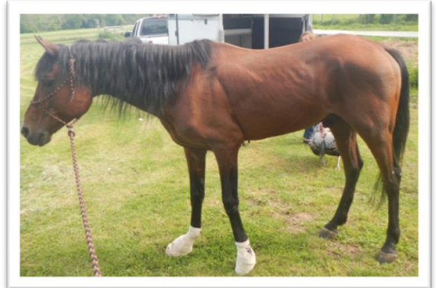
This is me the day I came home from the hospital.

Since I came to Spring Hill several other animals from all over the state have needed Spring Hill's help too. You see, there are dozens of humane societies and animal rescues in Vermont that take in dogs, cats and other small animals. They do good work too but they just aren't equipped to take in large animals like horses, goats and other livestock. Spring Hill fills that gap. They have trained humane agents that specialize in animal cruelty investigations, trucks and horse trailers, and a facility to bring large animals in need of urgent care to. They have rescued, rehabilitated and rehomed thousands