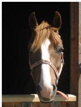
Rain Beau Creek "Beau"