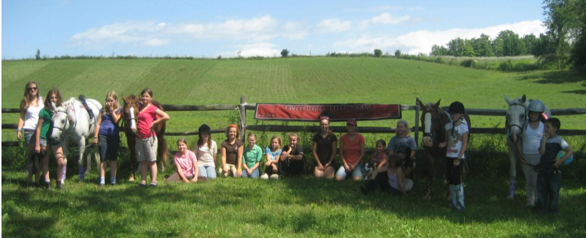
Most of the 2010 THF Day Camp Gang

Prices are the same as 2009 & 2010, but this year we are offering 6 weeks of camp!