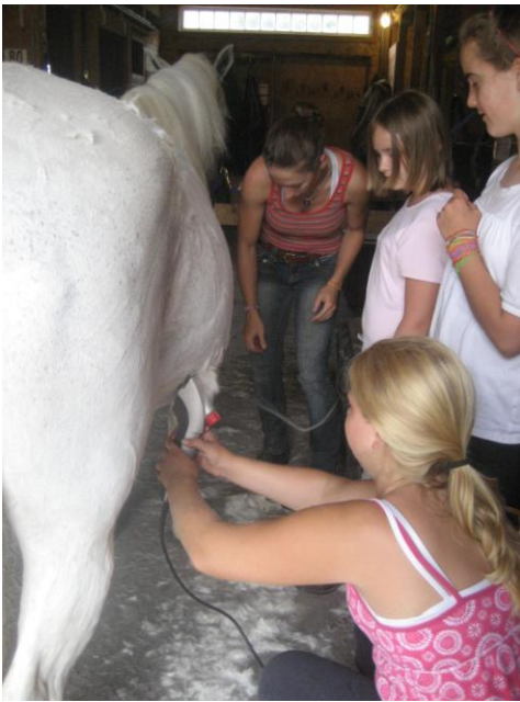
Shadow (shown in a 2010 hands-on body clipping lesson at camp)